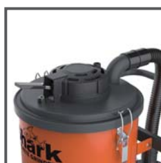
Jet pulse filter cleaning