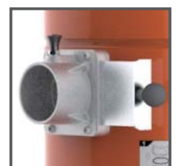
D70 aluminum inlet