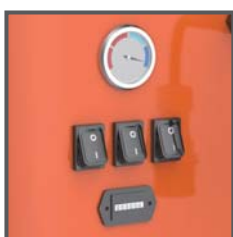
Independent motor controls