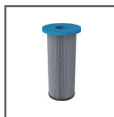
Hepa filter (H13)