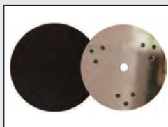
Convenient Design Pad Holder