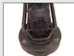
IE2 High Grade WD Motor