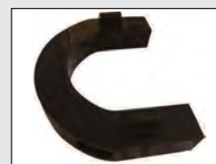
40kg Extra Weight