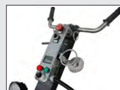
360° Adjustable Handle