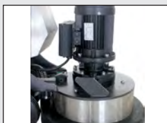
2.2kw, 3hp Motor