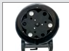
Variable Design Plate