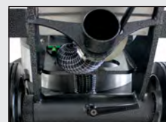
50mm Dust Port