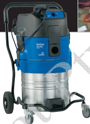
▲ ATTIX 751-61

The Liquid-Vac will pick up water at 200 liters per minute and discharge it as much as 9 m higher and 50 m away from the cleanup.