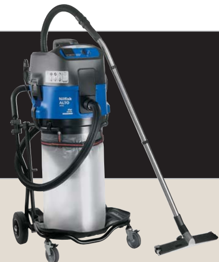
▲ ATTIX 736-21 ED