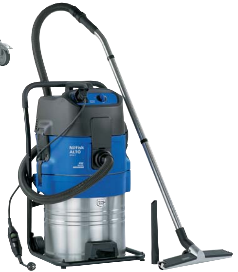
▲ ATTIX 751-71

Specifically designed and equipped for Fire Brigade use, cleaning up after highway accidents or fires.