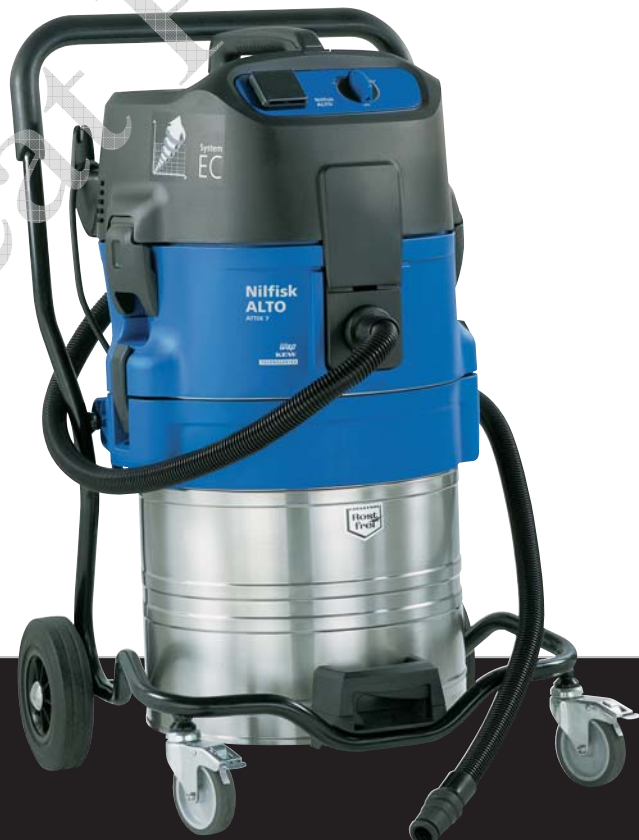
▲ ATTIX 791-21

for users with the tilting and removable container, and optional features like XtremeClean and Automatic On/Off.