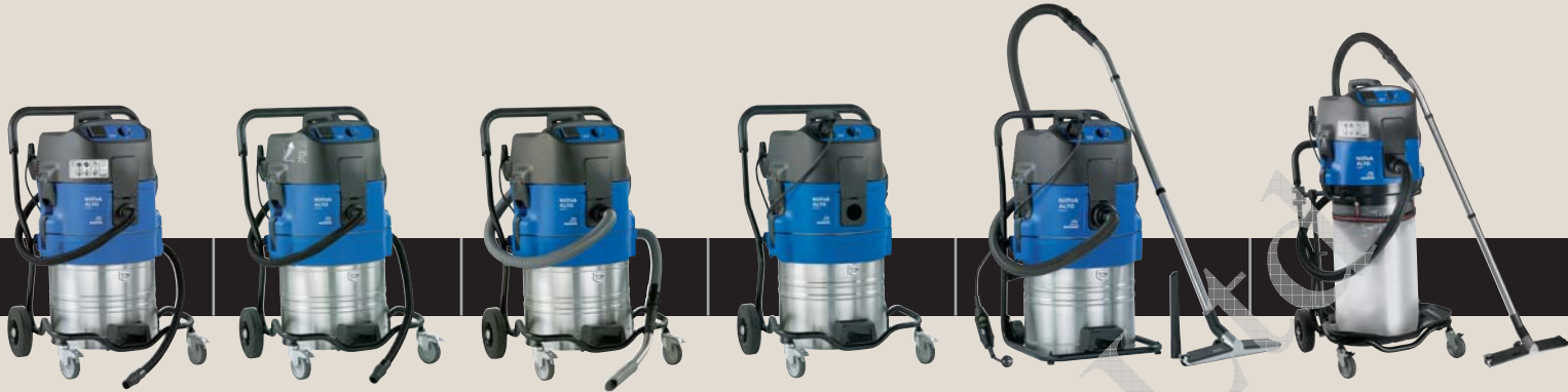
▲ ATTIX 761-21 XC